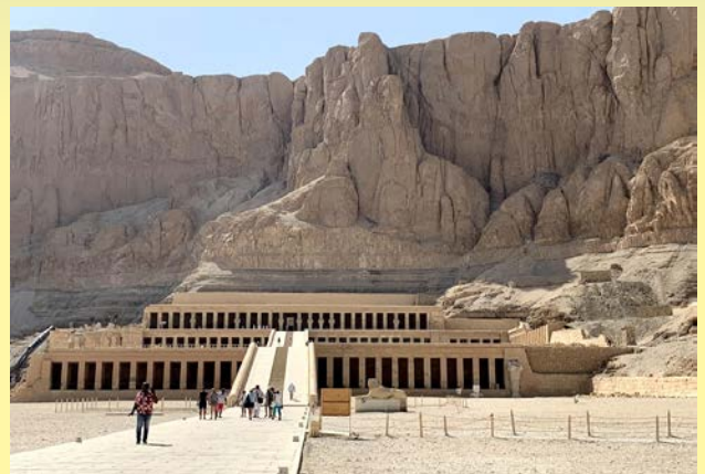
Queen Hatshepsut's Mortuary Temple